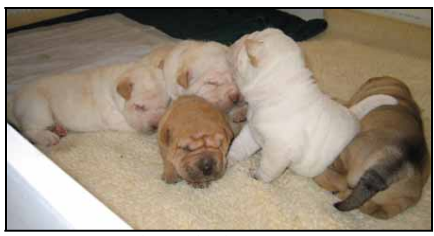
Recently spotted in the Watson's Home

Your knowledge and involvement can mean a world of difference in the safe handling of your dog.