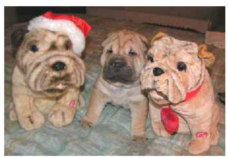
Can you find the real puppy?

http://www.activistcash.com/organization_overview.cfm/oid/136