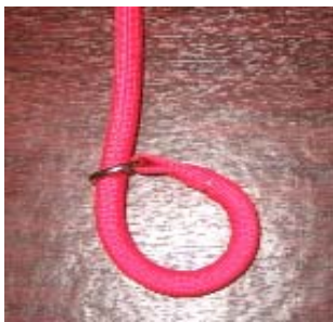
Push the collar through One ring of the collar

When putting the collar on, the part of the chain connected to the live ring (the ring the leash is connected to) should be on top of the dog's neck. The collar should release and relax when there is no tension on the collar.