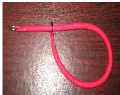
Make a P shape out of the collar