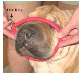
Put the P shape over the dog's head with the live ring on top.

With a Martingale collar, you need to make sure that it is adjusted properly to the size of your dogs neck. It should fit snugly on the neck. The top section, that you hook the leash to, will tighten up and loosen as you walk with your dog.